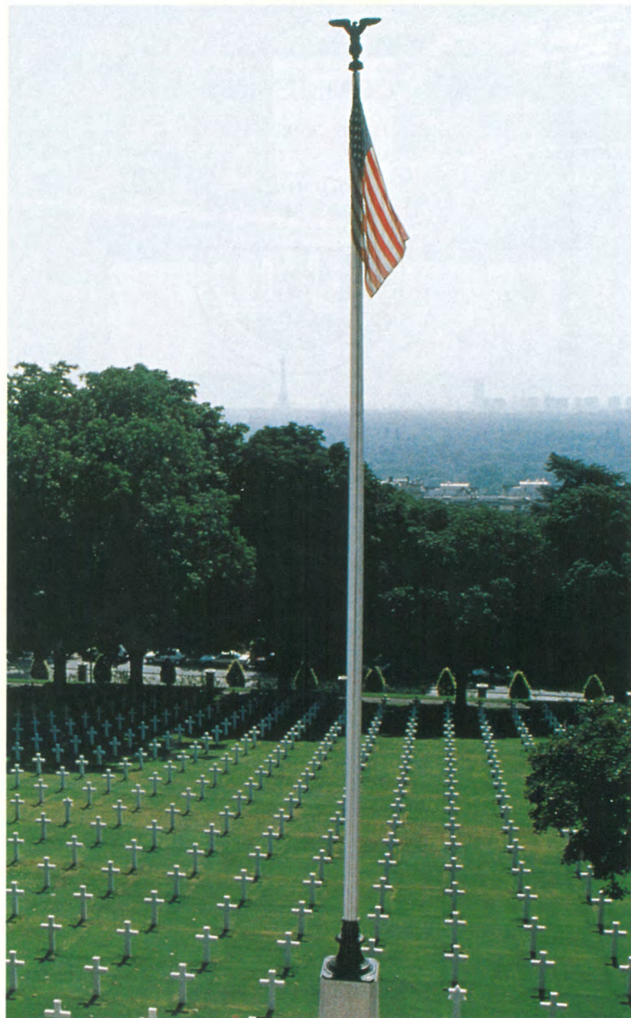
Suresnes American Cemetery and Memorial, Seine, France