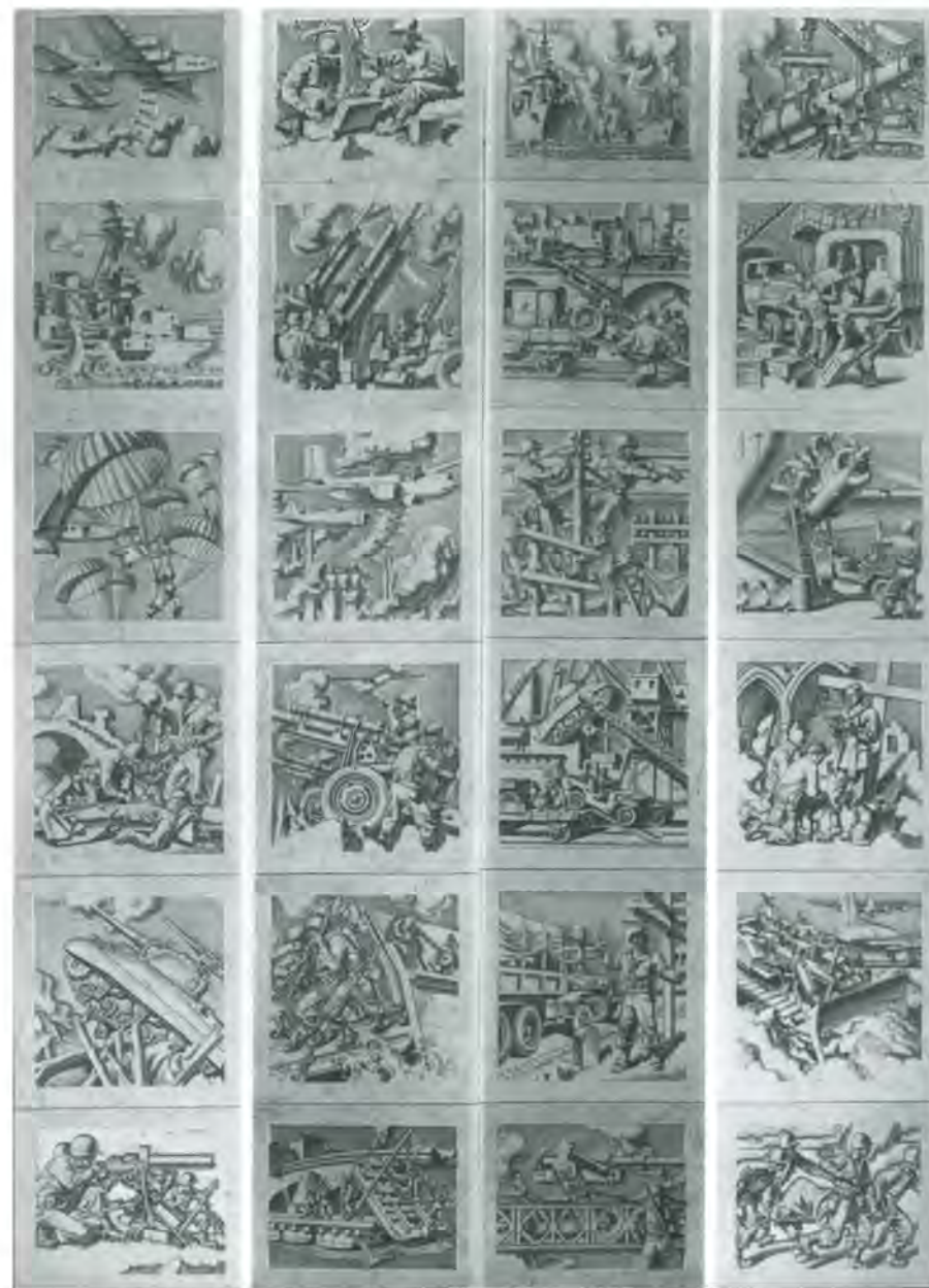
Side Panels to Wall Maps

REACTING PROMPTLY AND DECISIVELY, THE ALLIES RUSHED ALL AVAILABLE RESERVES TO THE SCENE. A FURIOUS STRUGGLE DEVELOPED AT THE ROAD CENTER OF ST. VITH WHERE THE ENEMY ADVANCE WAS STUBBORNLY DELAYED. AT BASTOGNE, ALTHOUGH SURROUNDED FOR FIVE DAYS, AMERICAN TROOPS, WITH THE HELP OF SUPPLIES DROPPED BY IX TROOP CARRIER COMMAND AIRCRAFT, MAINTAINED THEIR DEFENSE. WHILE THE FIRST ARMY