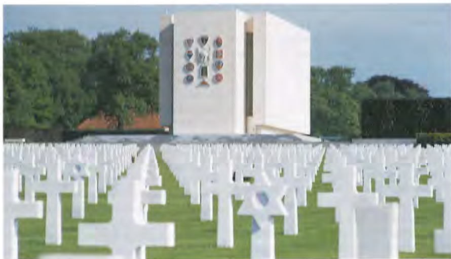
Graves Area and North Facade of Chapel

The Ardennes American Cemetery, 90½ acres in extent, is one of fourteen permanent American World War II military cemeteries constructed on foreign soil by the American Battle Monuments Commission. The site was liberated on 8 September 1944 by the 1st Infantry Division. A temporary cemetery was established on the site on 8 February 1945. After the war, when the temporary cemeteries were disestablished