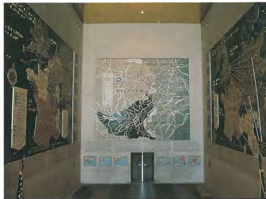
Ardennes and Rhineland Operations Map, South End of Chapel

by the Army, the remains of American military Dead whose next of kin requested permanent interment overseas were moved to one of the fourteen permanent cemetery sites on foreign soil, usually the one which was closest to the temporary cemetery. There they were interred by the Graves Registration Service in the distinctive grave patterns proposed by the cemetery's architect and approved by the Commission. The design and construction of all facilities at the permanent sites were the responsibility of the Commission, i.e., the chapel, museum, visitors' building, superintendent's quarters, service facilities, utilities and paths, roads and walls. The Commission was also responsible for the sculpture, landscaping and other improvements. Many of those interred here died during the enemy's final major counteroffensive in the Ardennes in December 1944 and