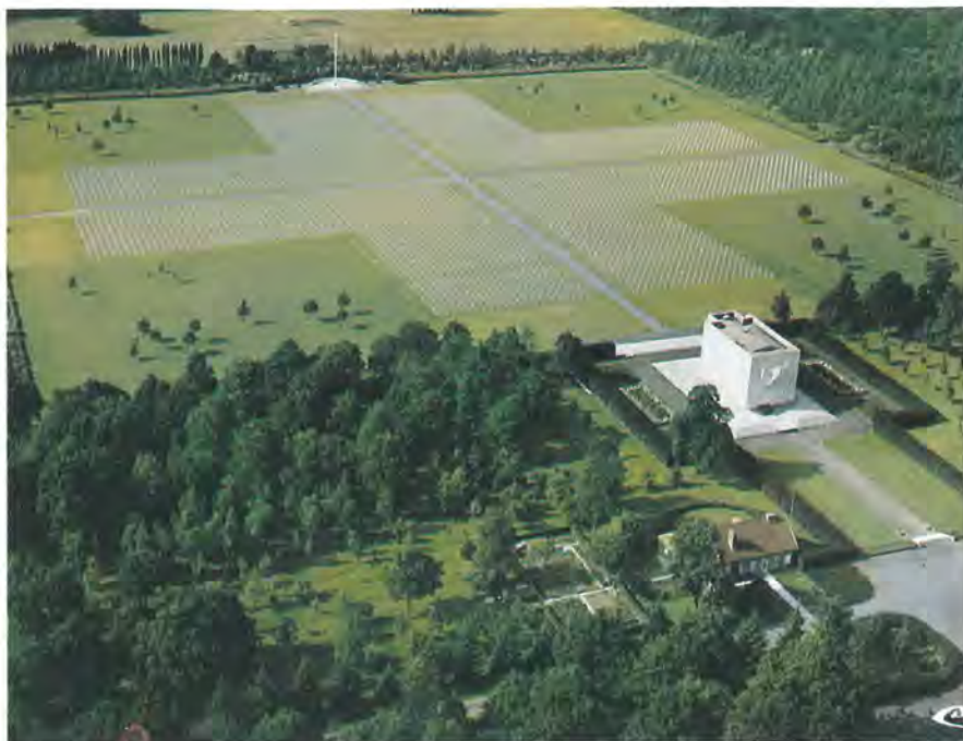
Aerial View of Cemetery and Memorial

During these hours, a staff member is always on duty at the Visitors' Building to answer questions, and to escort relatives to gravesites and to the Tablets of the Missing.