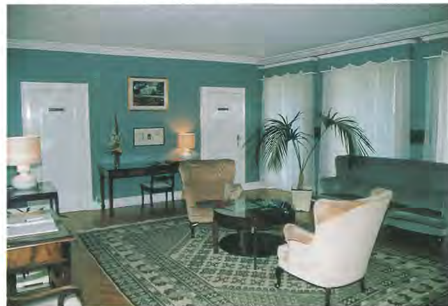
Interior of Visitors' Room

TO THE SILENT HOST WHO ENDURED ALL AND GAVE ALL THAT MANKIND MIGHT LIVE IN FREEDOM AND IN PEACE.