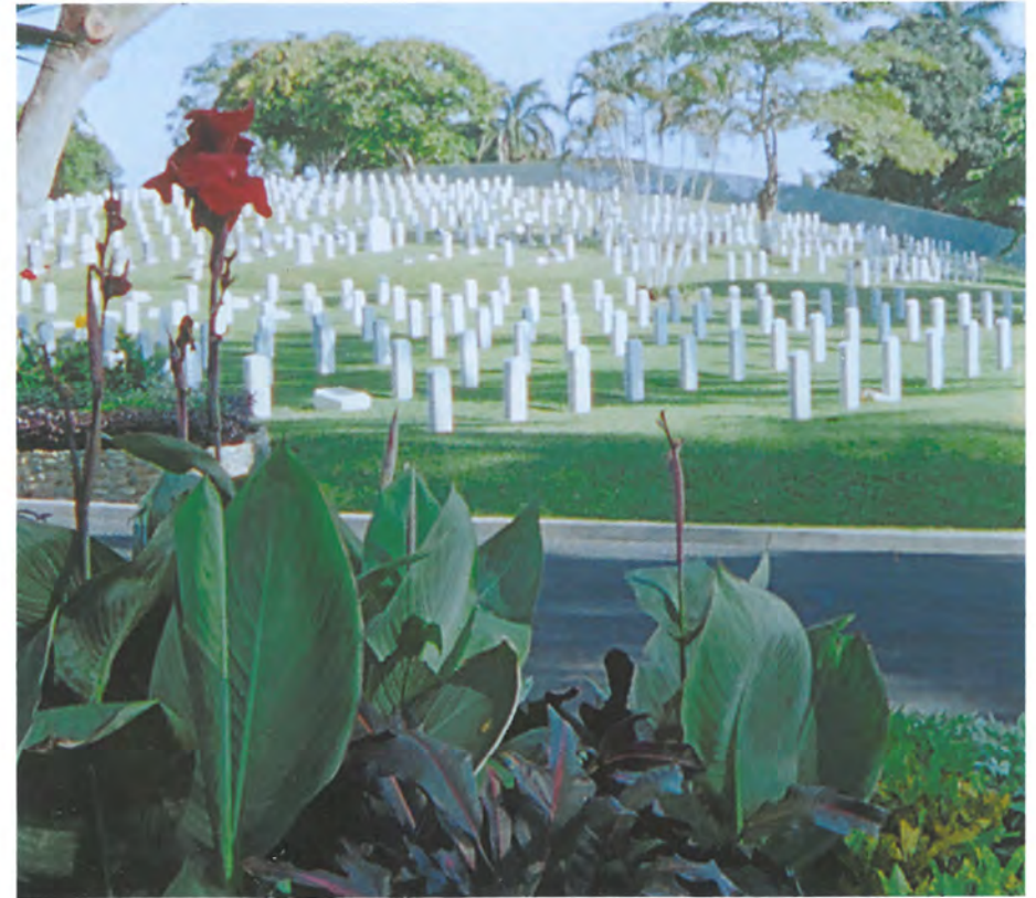
Corozal American Cemetery, Corozal, Republic of Panama