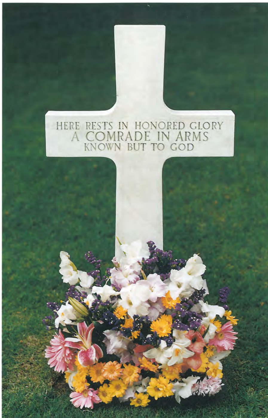
Decorated Gravesite of a World War II "Unknown"