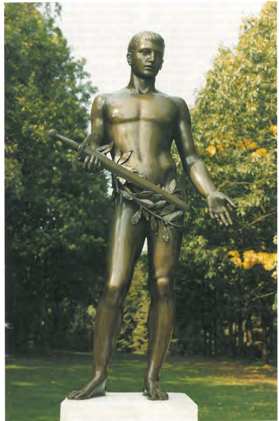
Jennewein Statue of "Youth," East End of Transverse Pathway

SUSTAINED BY THE HERCULEAN ACHIEVEMENTS OF ARMY AND NAVY SUPPLY PERSONNEL, THE ALLIED GROUND AND AIR FORCES PURSUED VIGOROUSLY. BY MID-SEPTEMBER THE U.S. NINTH ARMY HAD LIBERATED BREST; THE FIRST ARMY HAD SWEEPED THROUGH FRANCE, BELGIUM AND LUXEMBOURG AND WAS STANDING ON THE THRESHOLD OF GERMANY; THE THIRD ARMY HAD REACHED THE MOSELLE AND HAD JOINED FORCES WITH THE U.S. SEVENTH AND FRENCH FIRST ARMIES ADVANCING NORTHWARD FROM THE MEDITERRANEAN. ON THE LEFT FLANK, BRITISH AND CANADIAN TROOPS HAD ENTERED THE NETHERLANDS. ON 17 SEPTEMBER THE IX TROOP CARRIER COMMAND AND THE ROYAL AIR FORCE DROPPED THREE AIRBORNE DIVISIONS IN THE NIJMEGEN-ARNHEM AREA IN A BOLD BUT UNSUC-