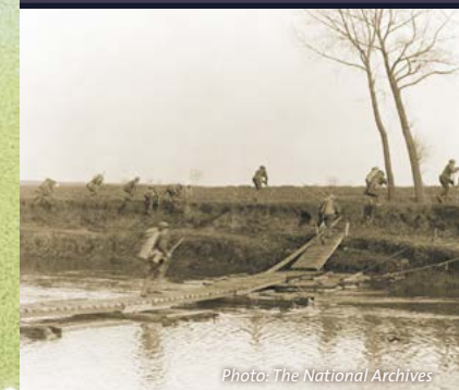
Soldiers of the 146th Infantry, 37th Division, crossing the Scheldt River at Nederzwalm under fire.

The deceased are buried in four identical rectangular plots, each containing 92 graves.