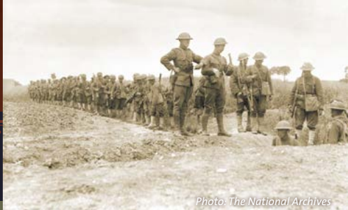
Soldiers of the 119th Infantry, 30th Division, entering trenches at Watou, Belgium. July 9, 1918.