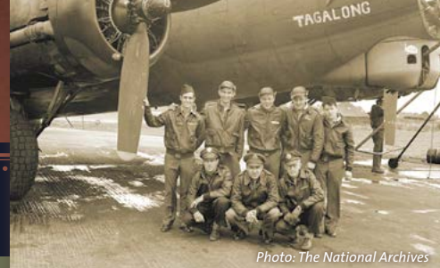
A B-17G aircrew of the 379th Bombardment Group (H), Eighth Air Force