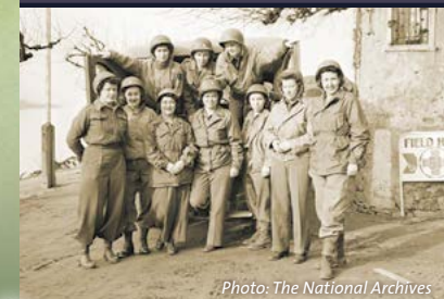
The first Army nurses to cross the Rhine with the 51st Field Hospital.

A boy or young man holding a sword and laurel wreath reminds us that those buried here died in the prime of their lives. They embody the meaning of sacrifice.